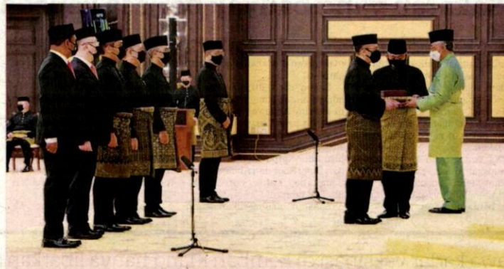
AL-SULTAN ABDULLAH (kanan) mengurniakan Surat Cara Pelantikan kepada Hishammuddin pada istiadat Mengangkat Sumpah Jawatan di Istana Negara semalam.

Pada istiadat semalam, kesemua Jemaah Kabinet melafazkan ikrar sumpah jawatan dan taat setia sebelum menandatangani