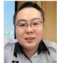
BK Tan says there is a need to protect green spaces to minimise flash floods.

By EDWARD RAJENDRA edward@thestar.com.my