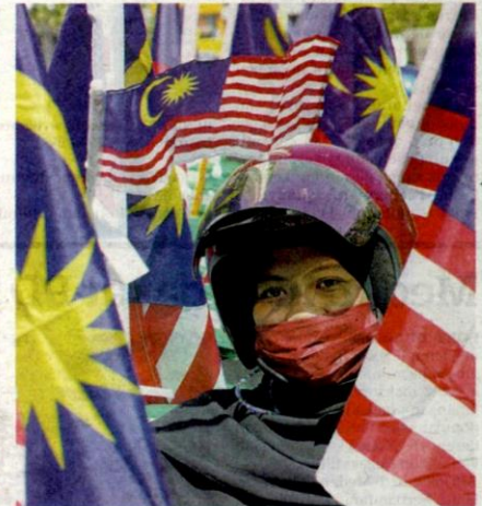
SEORANG penghantar makanan mengibarkan bendera Malaysia di pekarangan Pejabat Ahli Majlis Perbandaran Kajang Zon 14, Jalan Changkat, Kajang, Selangor kelmarin.