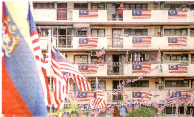
PENDUDUK memasang bendera Jalur Gemilang bagi memeriahkan lagi sambutan bulan kemerdekaan di Flat Sri Melaka, Cheras, Kuala Lumpur semalam. – APIQ RAZALI