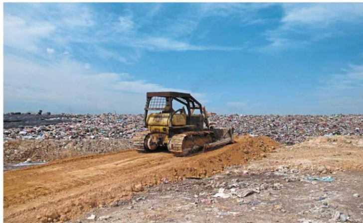
The 117.6ha landfill in Jeram can manage an average of 3,500 tonnes of solid waste a day.

Landfill in Jeram project could last for over 30 years, reps told