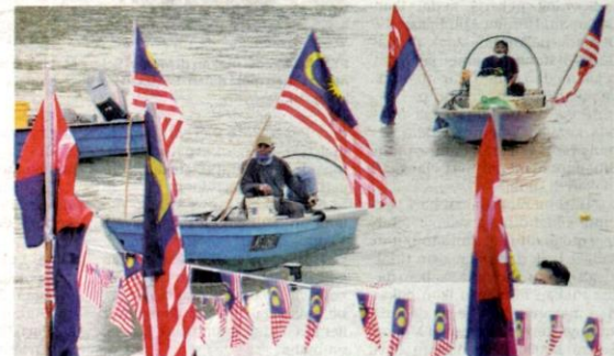
BEBERAPA buah bot nelayan yang dipasang Jalur Gemilang berarak di sepanjang Sungai Masal sempena menyambut Hari Kemerdekaan ke-64 di Kampung Pasir Gudang Baru, Pasir Gudang, Johor semalam.