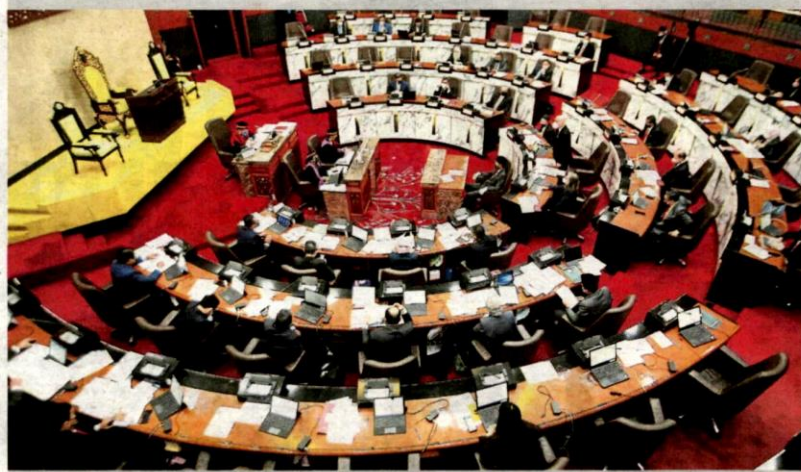
PERSIDANGAN Dewan Undangan Negeri (Dun) Selangor di Bangunan Dewan Negeri Selangor, Shah Alam, semalam.