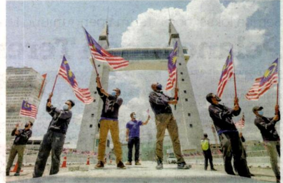
BEBERAPA kakitangan Terengganu Drawbridge mengibarkan Jalur Gemilang di Jambatan Angkat, Kuala Terengganu, Terengganu semalam.