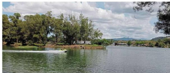
Among the parks that have been reopened in Selayang is Tasik Biru Kundang.

However, the guidelines did not state that morning and night market traders have to be fully vaccinated.