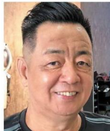
Tan: The questionnaire by MPK is defective as the wrong housing estate has been named.