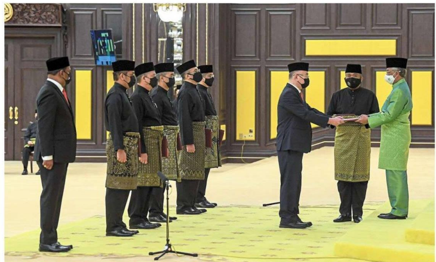
Assuming responsibilities: Sultan Abdullah presenting Wee with his instrument of appointment during the swearing-in ceremony at Istana Negara, Kuala Lumpur.

Headed by Datuk Seri Tuan Ibrahim Tuan Man, they comprised Datuk Seri Dr Maximus Ongkili, Datuk Seri Ronald Khandee, Datuk Seri Hamzah Zainudin, Datuk Seri Alexander Nanta Linggi, Datuk Seri Takiyuddin Hassan and Datuk Seri Noraini Ahmad.