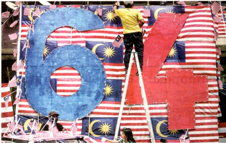
SEBAHAGIAN penghuni perumahan Sri Perantau memasang Jalur Gemilang di Kampung Selat Kelang, Klang, Selangor semalam.